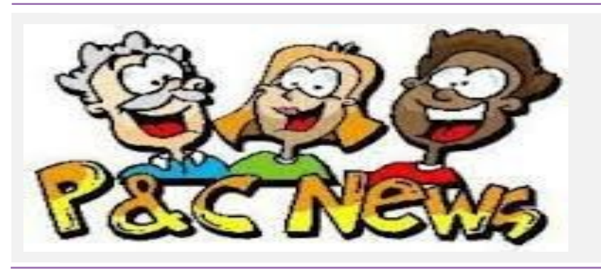
Bringing together parents, carers and citizens to promote the interest of our school and students!